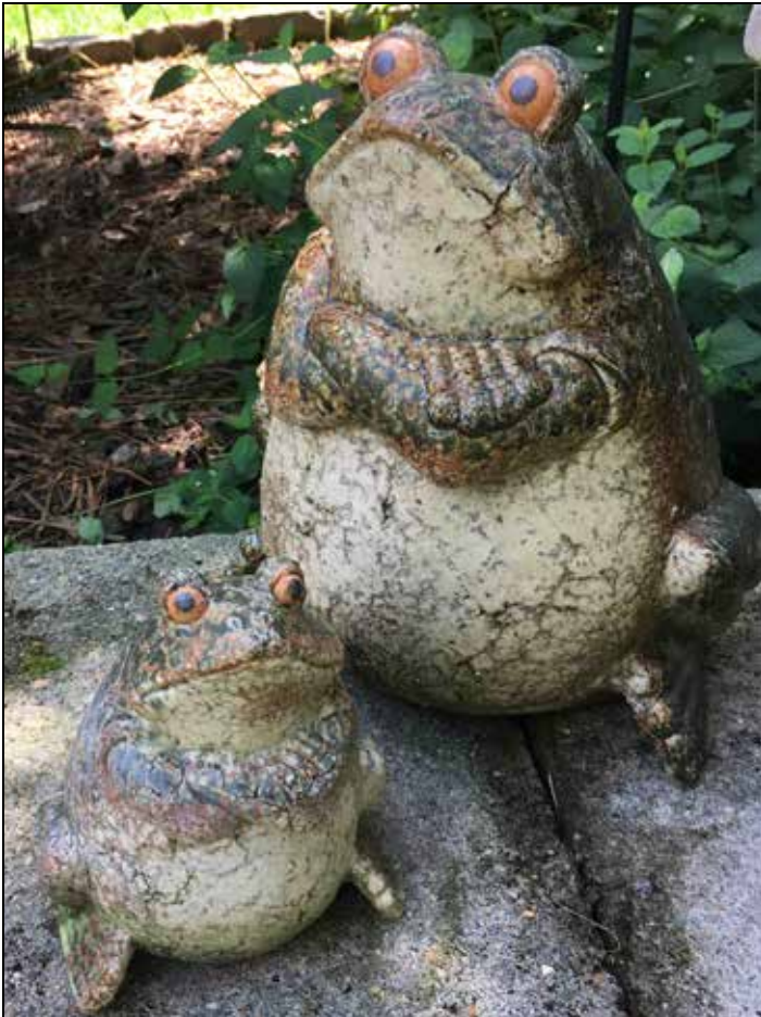
Toads surprised by visitors