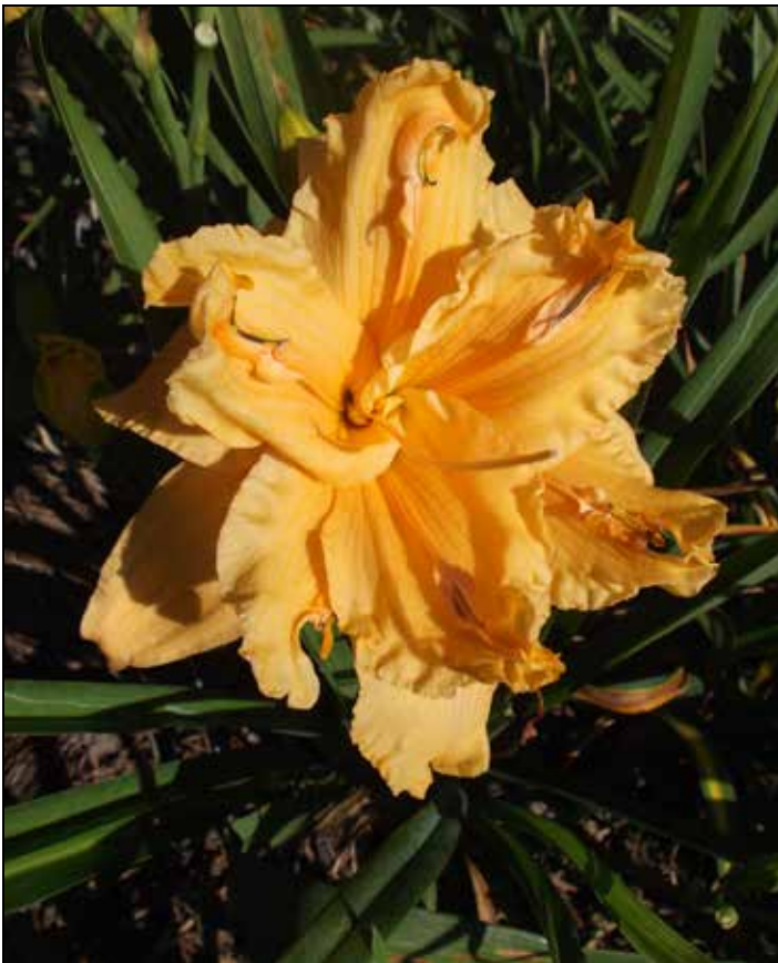
H. 'Point Clear Jubilee' (Falck-N. 2010) is one of many lovely doubles found at Kahatchee Gardens.

houses throughout the gardens. These birdhouses are constructed of old barn wood, cedar slabs, old corrugated metal roofing and decorated with moss covered English Ivy vines. The birdhouses sit upon unique cedar posts.