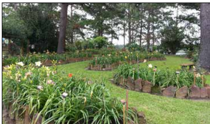
Long sweeping raised beds, edged in stone and filled to the brim with daylilies, characterize the grandeur of Suburban Daylilies.

The third garden we visited was the Gardens at Tree Topp, the garden of Jimmy Reeves. This Asian inspired garden was packed with a diverse variety of ornamental trees, flowering shrubs, annuals, perennials, and daylilies. The back yard featured a lovely lake view with a beautifully landscaped stone stairway down to the water.