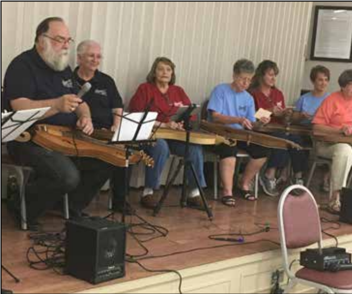
Magnolia Strings Dulcimers