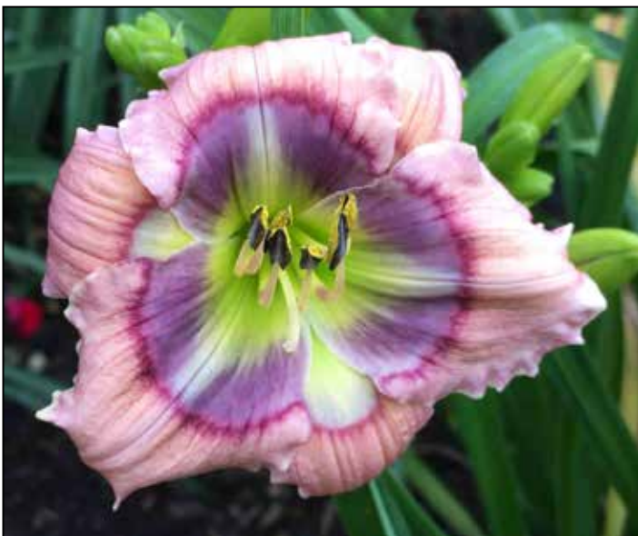
Individual Bloom Category First Place: H. 'Twilight Text' (Salter-E.H. 2008) Terese Goodson