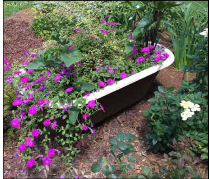
An old cast iron bathtub adorned with colorful flowers