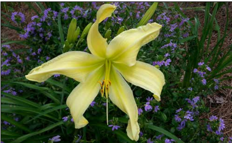
Daylilies with Companion Plants Category Second Place: H. 'Waiting on a Woman' (Dye-K. 2009) with lobelia Beverly Odom