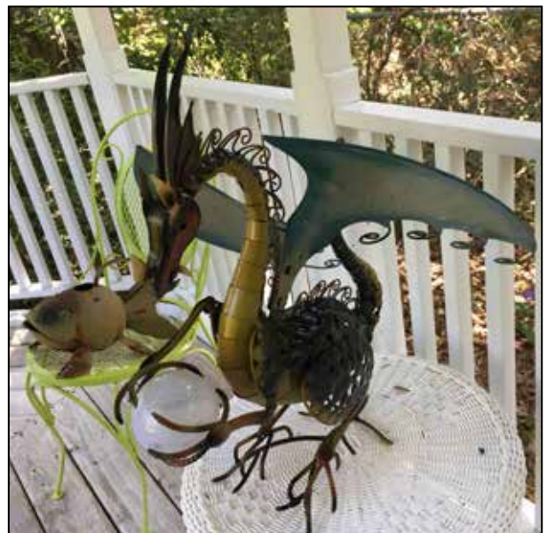
The sculpture at Dragon's Mead