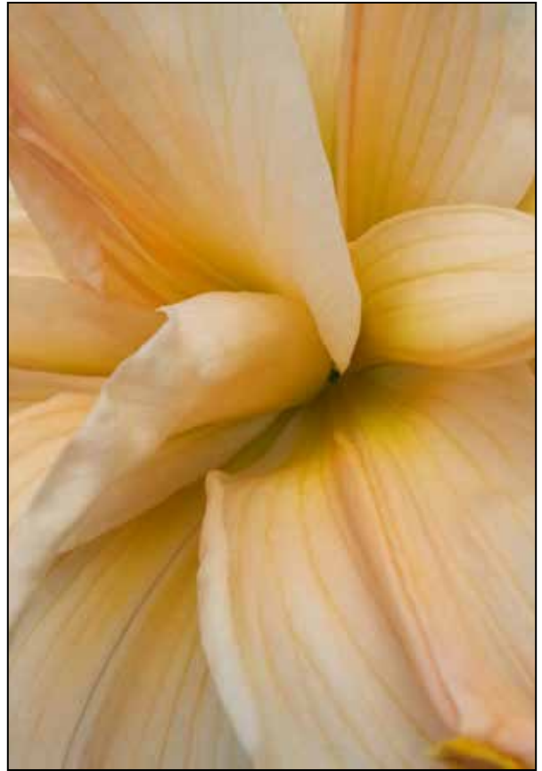
Artistic Category First Place: 'Scatterbrain' (joiner 1988) Beverly Odom