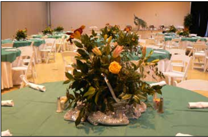
An example of the beautiful table decorations at the Spring Meeting