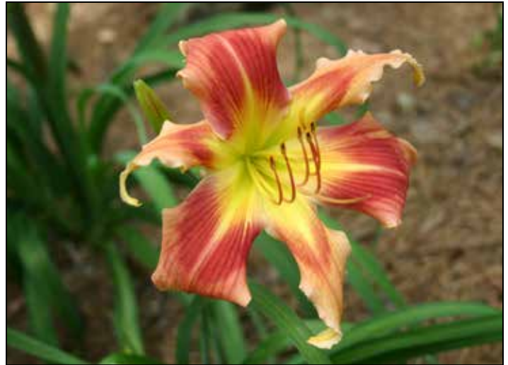
H. 'Who Dat' (Wilkerson 2011) One of many striking open form daylilies in the Montgomery garden