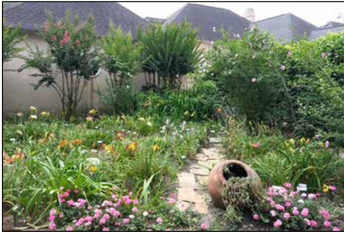
The Tibbetts garden provides a riot of color in a small, compact setting.

Our next stop was The Lily Meadow, the garden of Jon And Jeanette Tibbetts. This small suburban lot was packed with gorgeous daylilies. With stone paths meandering through the daylilies, surrounded by pretty Crepe Myrtles and punctuated with annuals, this garden was a compact beauty.