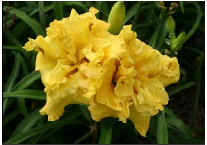
H. 'Signature Truffle' (Kirchhoff-D. 2008) was one of many pretty doubles blooming at FigLily.