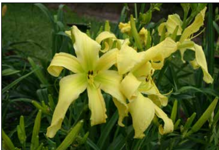
Awarded to the most outstanding clump of daylilies seen in a tour garden, the President's Cup went to H. 'Emma's Curls' (Falck-J. 2011) at Suburban Daylilies.

On display were bushes of azalea, crepe myrtle, gardenia, plus perennials of begonias, ferns, hostas, hydrangeas, and iris (Japanese and bearded). Red and pink-blooming Knockout roses accented many areas with bright blooms alongside numerous, ornamental trees. A welcome retreat at the back of the property leads visitors down pathways through sprawling gardens (daylilies, trees and companion plants) to the edge of Lake Serene. Interspersed around the area are charming architectural birdhouses. Everything is