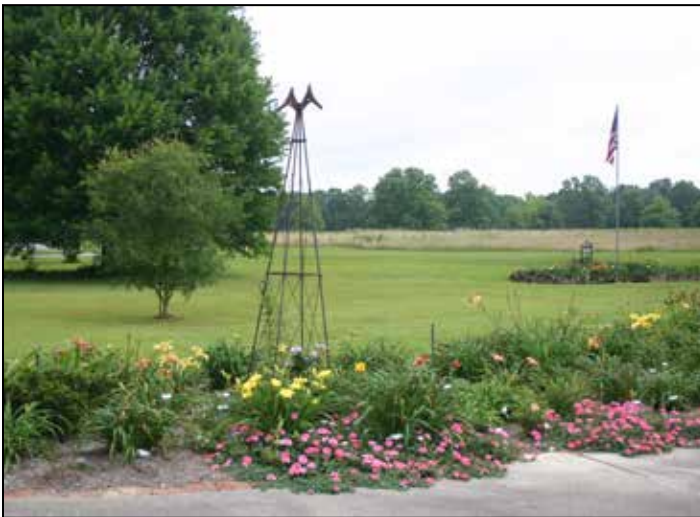
The drive leading to the home at FigLily Acres is bordered by large beds of daylilies. On the right is a bed containing plants registered by Earl Watts. The yellow is a clump of H. ‘Suburban Virginia Kirkpatrick’ (Watts 2008).

the patio is a cottage style garden with daylilies and a variety of companion plants including pentas, Shasta daisies, begonias, coleus, butterfly plants and many more. In this