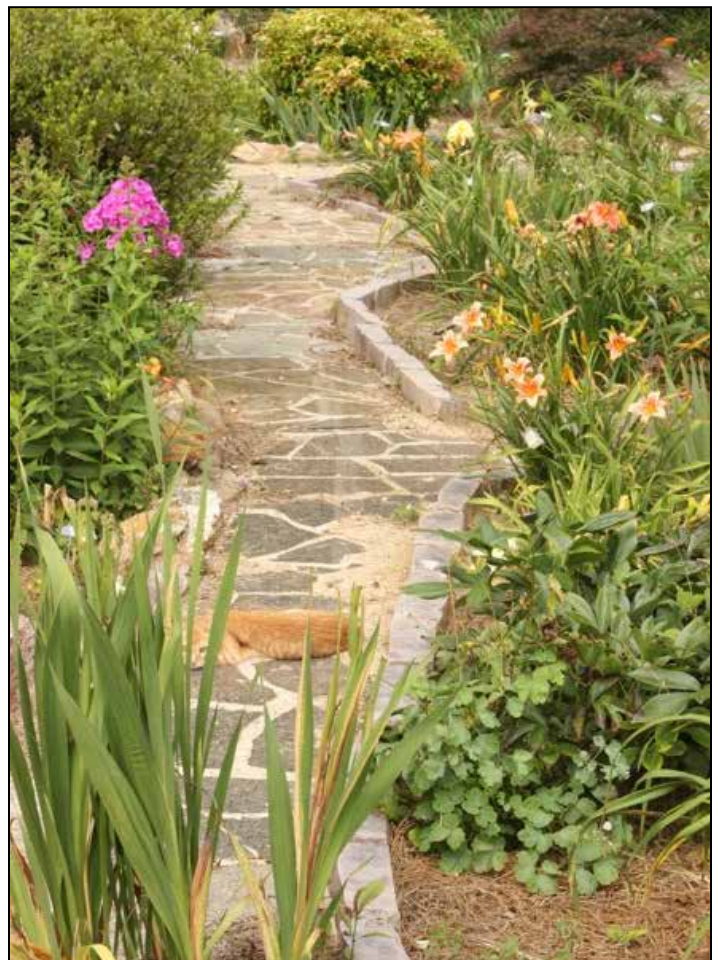
A marble path adds beauty to this charming garden which has plants in bloom during all seasons of the year.

In addition to companion plants such as German bearded iris, Siberian iris, Louisiana iris, roses, hostas, hydrangeas and oriental lilies, one will discover rustic bird