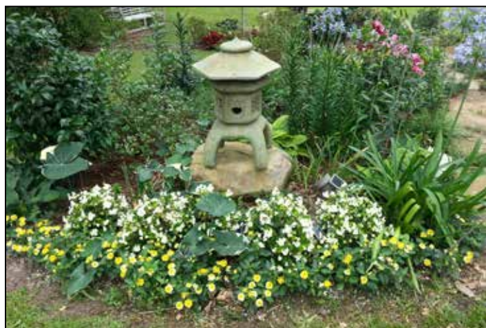
Tree Topp is an Asian inspired garden, featuring among its many shrubs, annuals and other perennials, delicate violet-blue agapanthus.