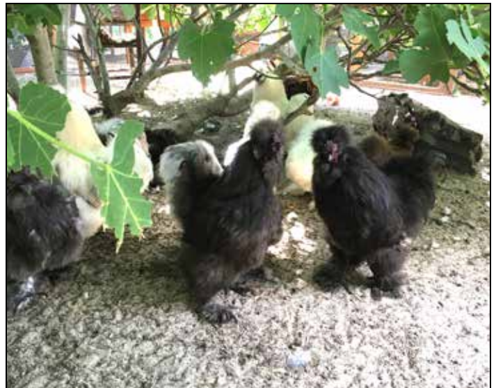
Graceland Gardens is known for something other than just daylilies, as the MADS tour group discovered in their encounter with these weird chickens.