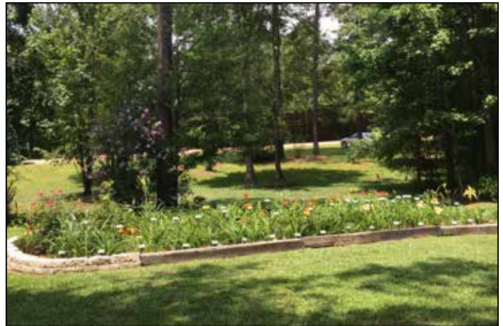
The beautifully landscaped Montgomery garden