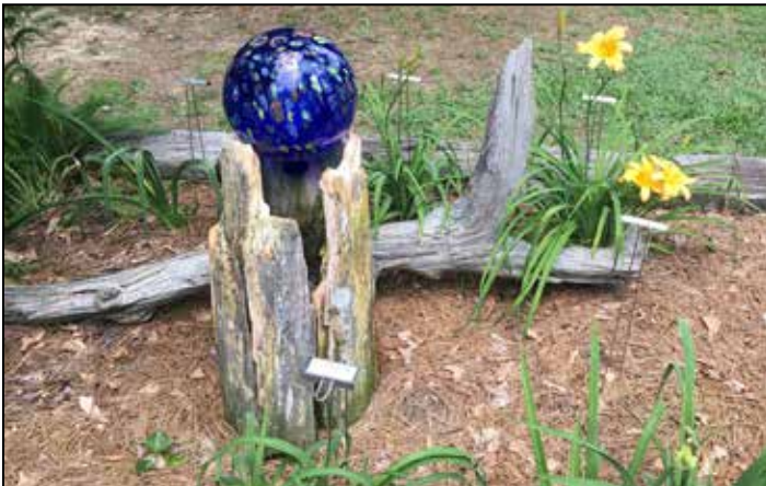
The royal blue gazing ball sitting atop driftwood

Sitting on top of driftwood, a royal blue gazing ball anchored the next daylily bed. A graceful bird bath, Rose of Sharon, and an unusual succulent strawberry pot were just some of the interesting features that were spotted nearby. A clump of Peruvian lilies, blooming roses, clematis trellising on “staghorn” stakes, adorable yard art, and many additional companion plants graced this happy garden. Heading deeper down the paths, you couldn’t miss the old cast iron bathtub adorned with mounds of petunias and elephant ears—such a lovely sight!