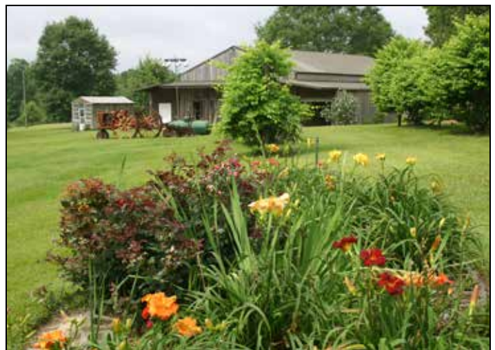
A large barn built out back has served as Edd’s workshop. The original barn located on the property held a treasure of farm implements.

After much clearing they built a house with a porch across the front. As in many southern homes, this porch has, among other furniture, three large, orange rocking chairs that compliment the surrounding flowers. They also built a large barn out back for Edd’s workshop. The old barn had a treasure of antique farm tools and equipment that has added interest and yard art to the grounds and present barn.