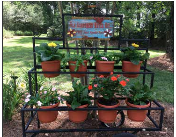
Pots with colorful blooms in shady areas

Concrete toads resting along the path may not have sported smiles, but the guests were all smiles when they discovered the small and miniature daylily beds near the house. The variety, intricate details, and colors of each cultivar were amazing, especially when you consider how tiny these flowers were. Snacks and cool drinks nearby were another reason for visitors to keep smiling.