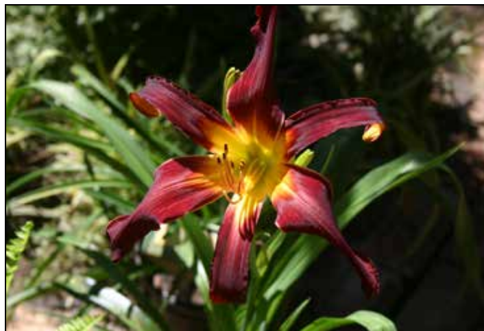
H. 'Suburban Joey' (Watts 2017)

Our first stop was Suburban Daylilies, the garden of Earl and Barbara Watts. Upon arrival we were greeted by long sweeping raised beds, edged in stone, and filled to the brim with lush, mature daylilies and companion plants. A personal favorite was the bed with an eagle statue perched in the center overlooking a mass planting of Hemerocallis 'Suburban Golden Eagle' (Watts 1998). Multiple garden areas, including a shaded patio, gazebo, and fish pond backed by the beautiful view of Lake Serene, made this a peaceful garden paradise.