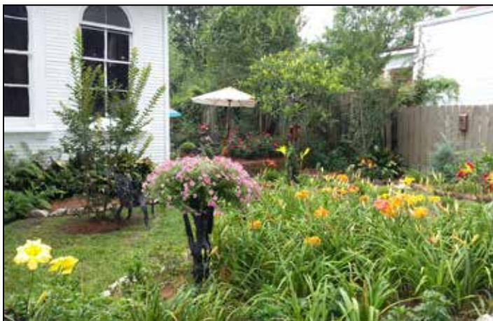
The Downtown Daylily Garden and Historic Cottage features a courtyard style garden.

After stopping for a quick bite to eat, we continued on to The Downtown Daylily Garden and Historic Cottage, the garden of Glenn Nobles and F. Durwood Blackwell. This beautifully restored home featured a courtyard style garden brimming with blooms and unique garden art. The patio area surrounded by raised brick planters offered plenty of seating to rest, relax, and enjoy the view.