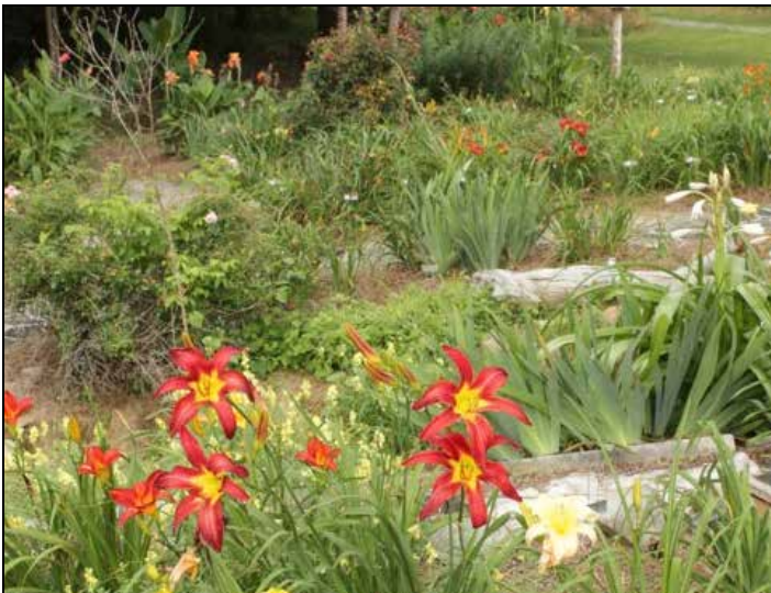
Over 1000 cultivars enhance the beauty of Kahatchee Gardens, many in large clumps.

Parts of our gardens have marble paths and there is a bridge connecting the gardens. Part of the metal in the bridge was salvaged from the McAllister house at Gants Quarry, Alabama.